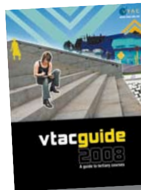
5 copies of the VTAC Guide 2008