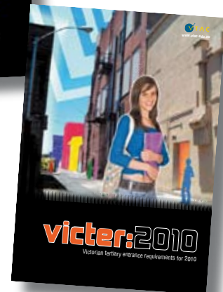
5 copies of VICTER 2010