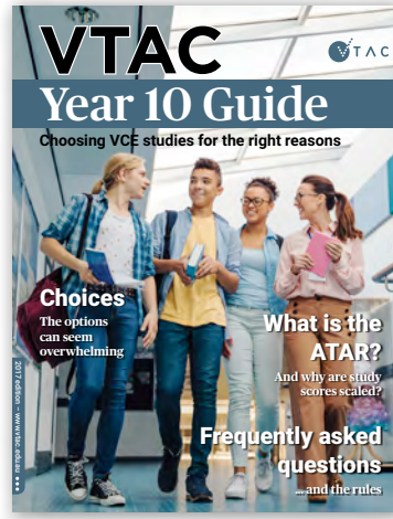
VTAC Year 10 Guide